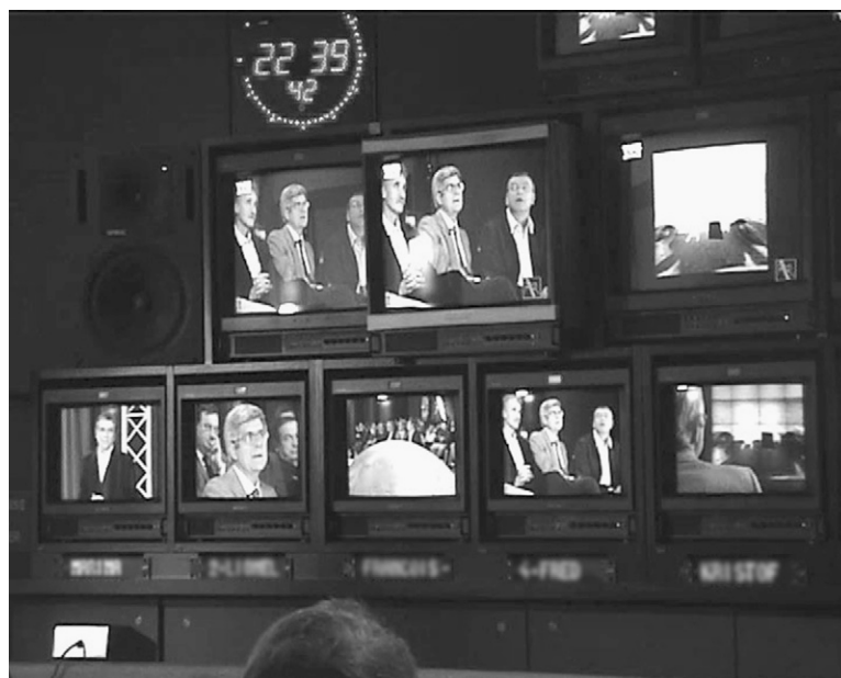
Image 4. Gesture barely visible on screen 3.

In the retranscription of extract (2), the moderator names a new guest by his first name, and, as we have already seen, this action is at first also taken as projecting this guest as next speaker by the members of the production crew. Just like extract (5), extract (6) introduces the transcription of a gesture by one of the guests: