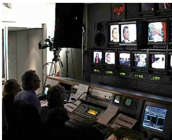
Image 1. The control room

The data consulted are video-recordings made inside the control room during the production of a series of live television interviews 8 . Three mini-DV cameras were used in order to capture: a contextual view of the director, the script and the technical director in front of the fairly large number of screens showing images of the different cameras and the screen showing what is currently on the air (image 1); a separate view of only the screens, permitting a better visibility of the detailed information visible on the screens (image 2); and a separate and strongly zoomed view of the screen showing the studio and its participants (image 3). In order to get an as good as possible recording of the verbal contributions by the personnel in the control room, a minidisk was also placed in front of them. The actual TV-programmes were recorded as well 9 .