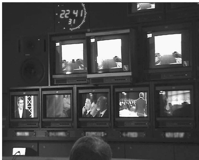
Image 6. Moderator covers gesture in screen 4.