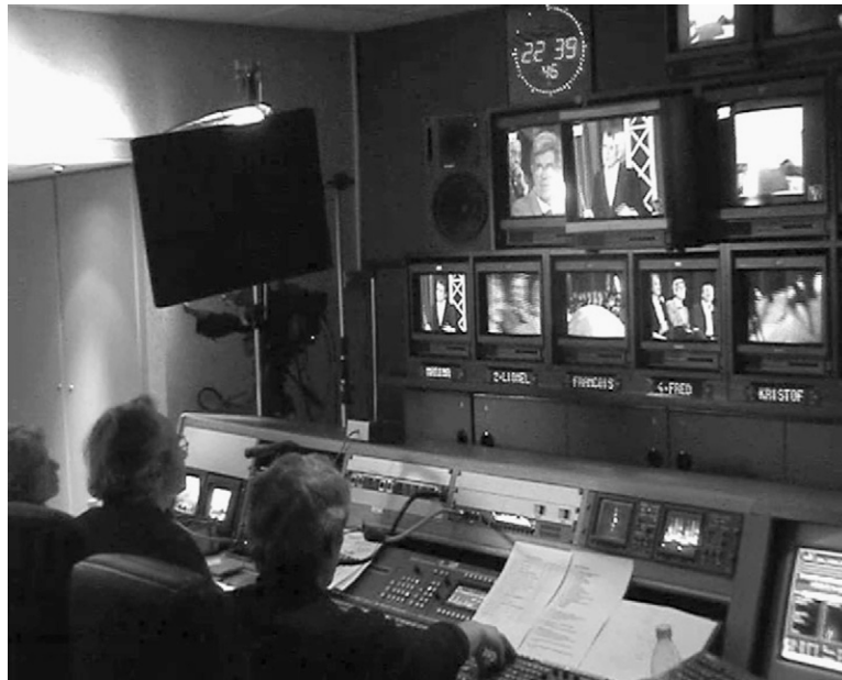
(3) RR040122-R [00:22:18 – 00:22:26] (French original)