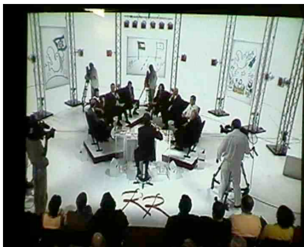
Image 3. Close-up of screen showing studio