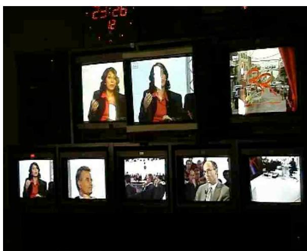
Image 2. Closer view of screens. Top centre is the image currently on the air. Lower row shows images of the five camera operators.